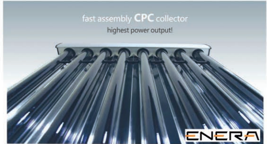
fast assembly CPC collector highest power output!